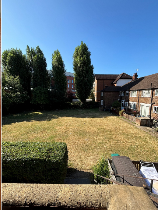
Well Maintained Communal Gardens