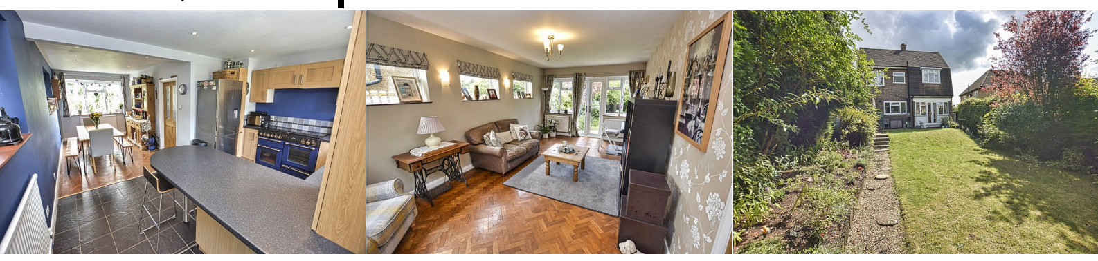
Great Tattenhams, Epsom